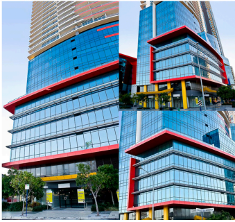
AGC Glass, AU 2017 Skyscraper facade from east side. Invisible Shield was used to treat glass for long term protection against contaminants and permanent corrosion.