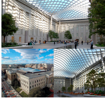
Smithsonian American Art Museum - Washington, DC 2016 Vulnerable horizontal glass can become easily corroded and quite labor intensive to clean. Invisible Shield coating was applied many years ago to preserve the glass and reduce the cleaning overall.