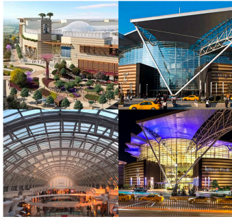
Istinye Park Izmir - Turkey 2020 Glass is one of the most alluring yet delicate compounds on the planet, often times it is damaged before it is even installed. Invisible Shield is being tested to treat much of the new glass construction.